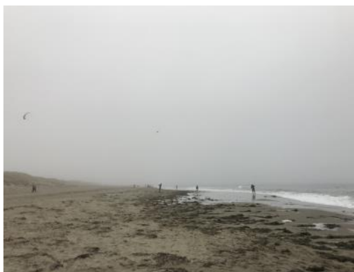
Celebrating Labor Day on the north coast. Shoreline walking, picnics, surf fishing, kite flying, surfing.