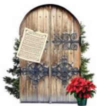
A Rebel's CHRISTMAS: Martin Luther's MUSICAL REFORMATION